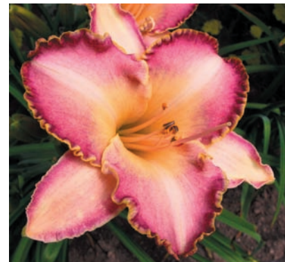
Phil's introduction 'Glory on High'