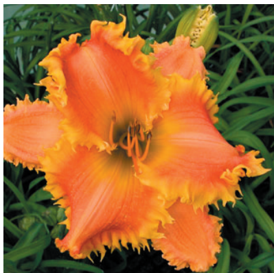
Above: H. 'Bass Gibson' Below: H. 'Beam Me Up'