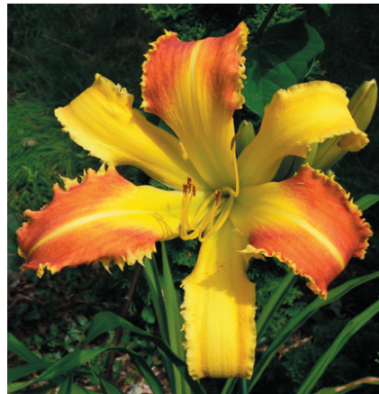
H. 'Laughing Giraffe'